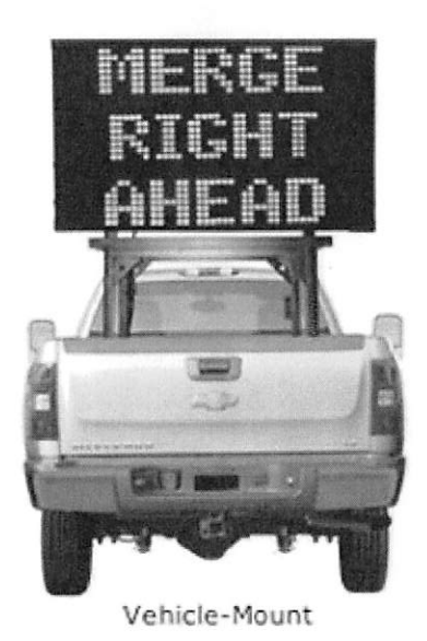
Vehicle Mount shown above Trailer Mount also available:

Available in either Vehicle Mount, Lift & Rotate or Standard Trailer Mount.